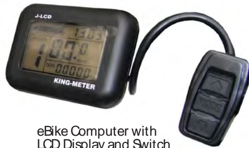
eBike Computer with LCD Display and Switch