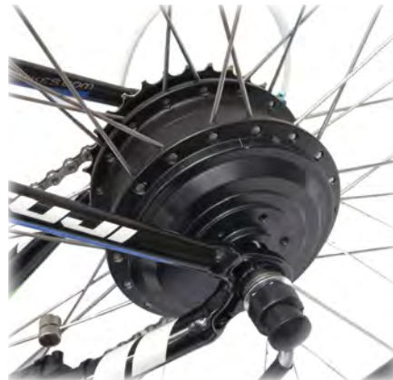
Hub Geared Motor